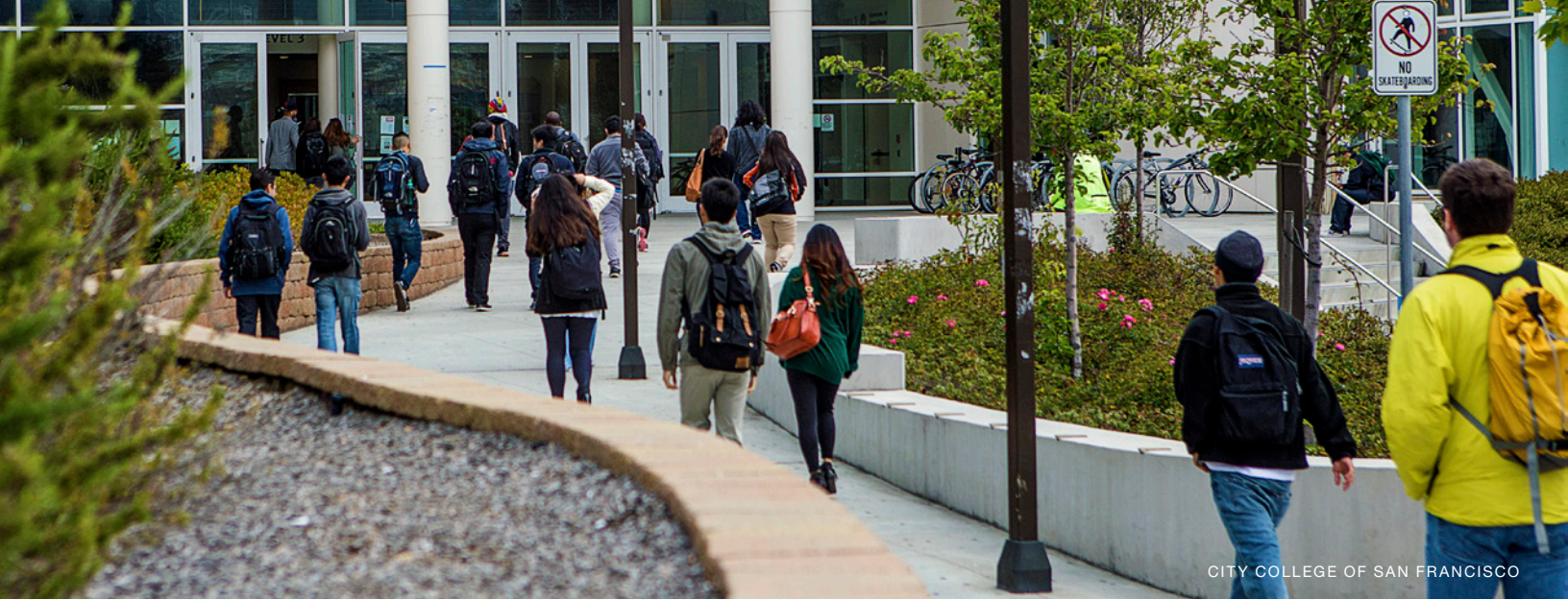
CITY COLLEGE OF SAN FRANCISCO